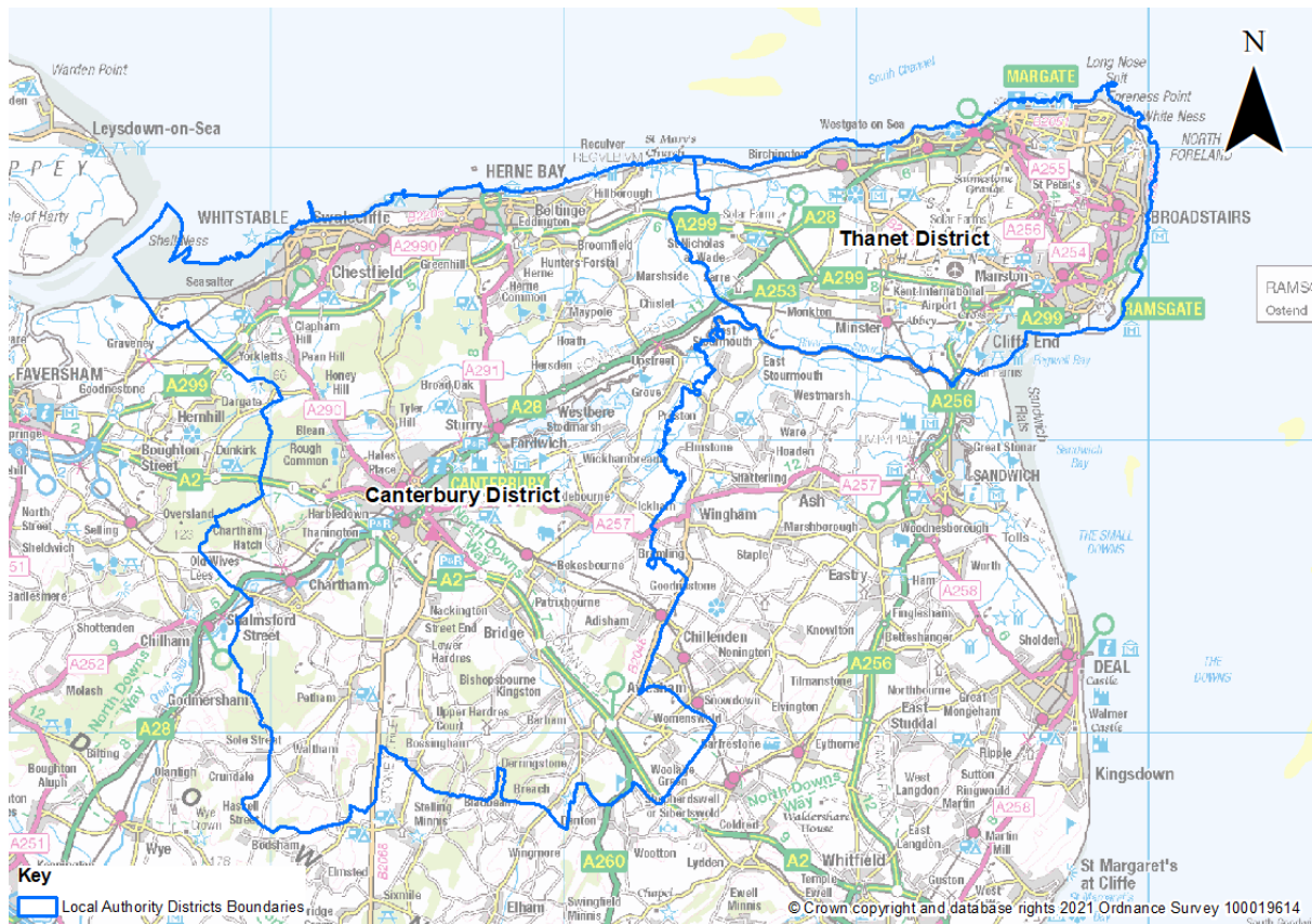
Figure 1 CCC and TDC boundaries.